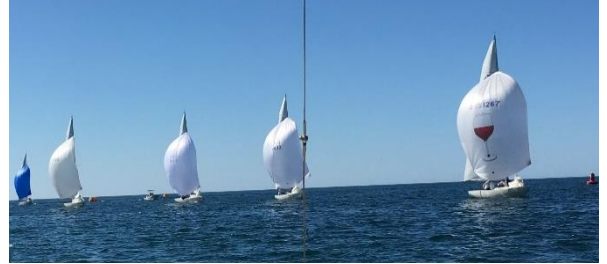
Columbus Match Racing Team – 3 rd in the last race. It must have been Bill's wine glass VMG and Bill sending us a message that he can still take us all on!