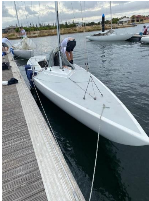
Out to show they could find the best angles