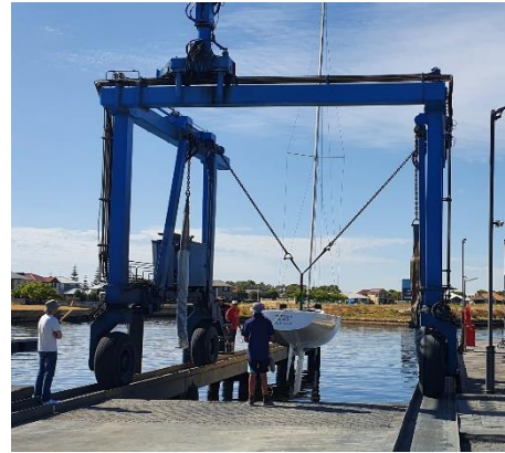
The marina guys simply 'made it all happen'