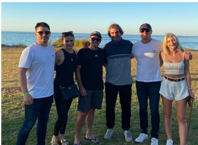
The Rat Pack plus support team