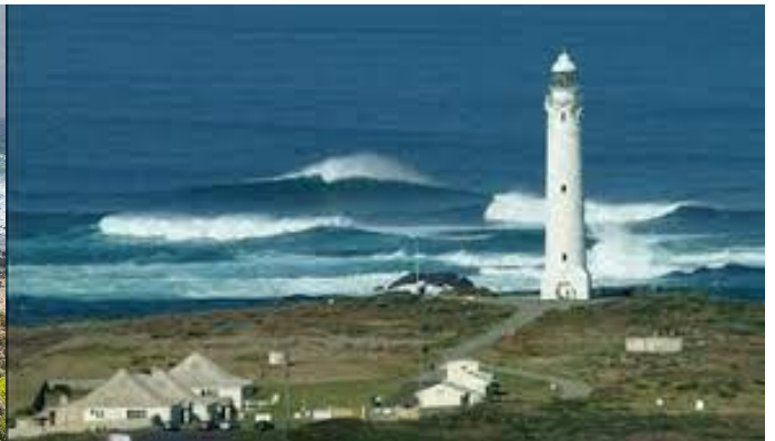
When the going gets tough, the tough go ... touring!

Cape Leeuwin Lighthouse is at the tip of at the most south-westerly point of Australia, where the Southern and Indian Oceans meet Built from local limestone in 1895 it is still a vital working lighthouse.